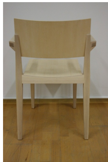
Figure 6 Tova armchair, from behind