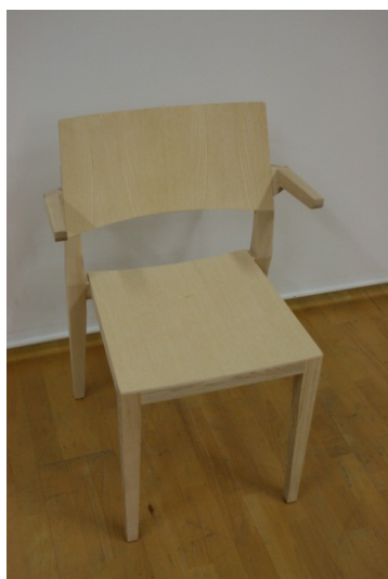
Figure 1 Tova armchair

Armrests length: 207 mm Armrests height: 26-31 mm Armrests width: 22-28 mm Other info: Armchair/arm rests in solid ash