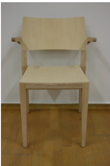
Figure 5 Tova armchair, front view