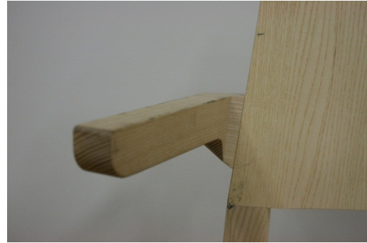
Figure 3 Tova, arm rest