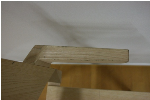
Figure 4 Tova, arm rest